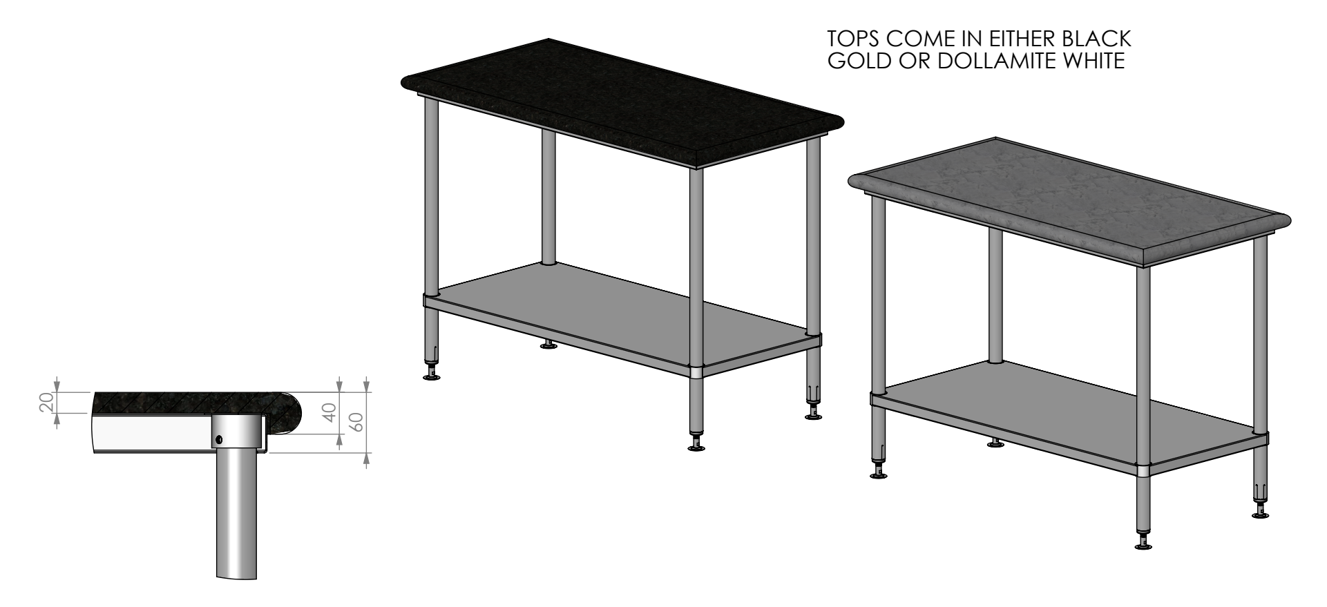
DETAIL A (GRANITE TOP DETAIL)